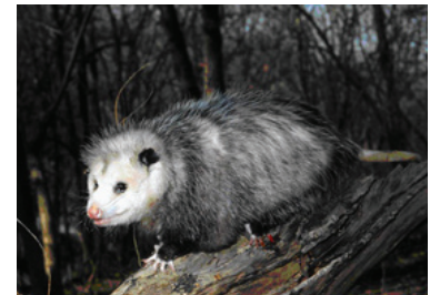
Figure 3. Opossum.

Opossums ( Didelphis virginiana ) have white to gray coloration in their fur, grow to the size of housecats and weigh around 10 pounds (Figure 3). Their pointed face and rat-like tail lead many people to consider them to be oversized rats. Opossums, however, are not rodents, but marsupials which, like kangaroos, have pouches and carry their young with them from an early age. Before the arrival of European settlers, opossums lived only in Nebraska’s extreme southeastern corner. Today, opossums are common throughout eastern Nebraska. In the Sandhills and Panhandle regions, they are generally restricted to major waterways.