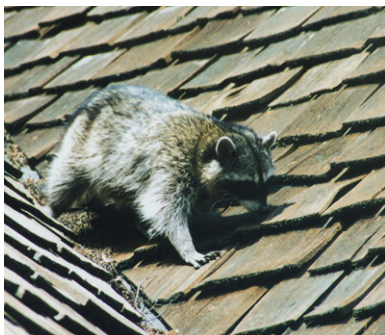
Figure 1. Raccoon on shingled roof.

Raccoons, with their black bandit mask and black- and brown-banded tail, are well known to Nebraskans (Figure 1). The word “raccoon” is derived from Native American words “arakum” or “aracoun,” meaning “he scratches with his hands.” Adult raccoons