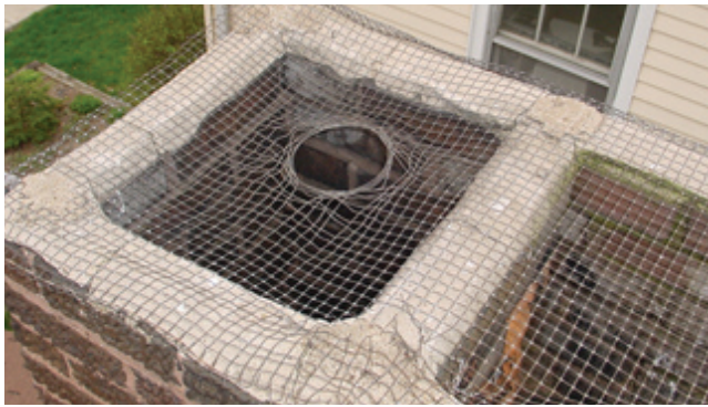
Figure 7. A raccoon made a home in this chimney after breaking through this “home-made” chimney screening. Non-professional screenings also may become packed with snow or ice thereby forcing toxic exhaust gases back into the home.

Secure crawl spaces below sheds, porches, and decks using 1 inch x 1/2-inch galvanized hardware cloth. Bury the mesh at least 4 inches below the soil and create a 12- to 18-inch skirt under the soil to discourage digging. Some suggest digging down at 12-24 inches with a 12-inch perpendicular skirt. Consult Diggers Hotline of Nebraska, 800-331-5666, before initiating any digging. If aesthetics are a concern, consider painting the mesh with flat-black paint. Install lattice over it to reduce visibility.