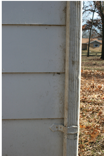
Figure 4. Brown smudge marks and fine scratches on a vertical surface are key signs of raccoon use.

Damage caused to crops and livestock can be very difficult to identify with a specific species. Sometimes, one animal may kill a chicken only to have another animal feed on the remains. Identification can be assisted through four primary means. First, investigate the manner used to gain access to the area. Did it require climbing? While raccoons and opossums will climb or squeeze under or through a fence, they usually will avoid digging extensively to gain access. If structures are involved, carefully check for openings. Opossums need an opening that is at least 3 inches wide, while raccoons need at least 4. Carefully investigate trees that could be used as "bridges" to the roof line. Look for scratches or brown smudge marks on the tree or building where the animal has climbed ( Figure 4 ). Second, were footprints left behind? Both species have distinctive paw prints ( Figures 5 and 6 ). Third, were any feces left behind?