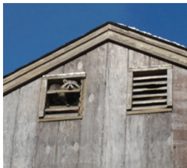
Figure 2. Raccoons can easily enter buildings through unsecured attic vents.

Raccoons do not construct their own dens but will use abandoned dens, hollow trees, crawl spaces, storm drains, attics, and chimneys (Figure 2). Raccoons have been known to tear through