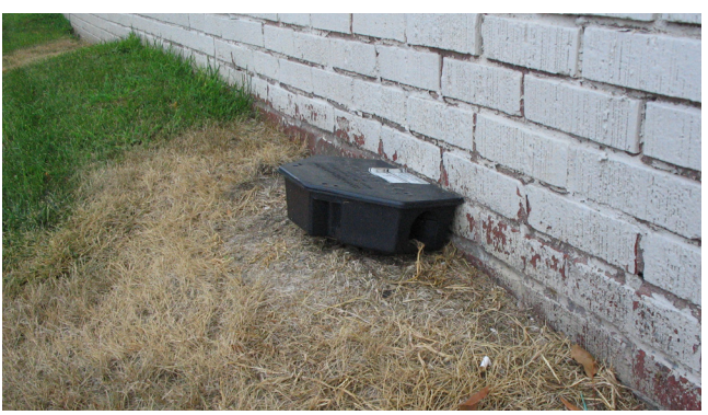
Figure 4. Rat-sized bait station properly placed against the exterior wall of a building.

in direct sunlight, choose gray- or white-colored stations and use non-paraffin-based toxicants.