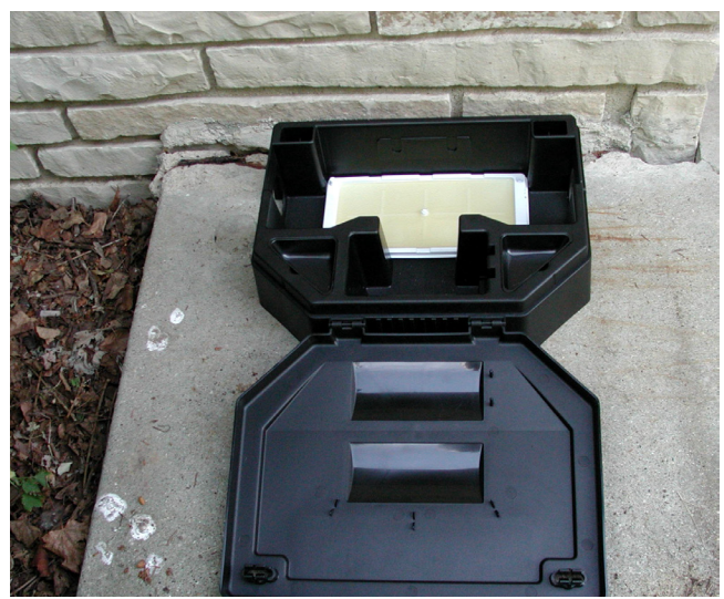
Figure 1. AEGIS<sup>TM</sup>-RPBait Station (Liphatech, Inc.) holding a glue board. Many manufactured bait stations are designed with the flexibility to be used with traps, glue boards, and toxicants.