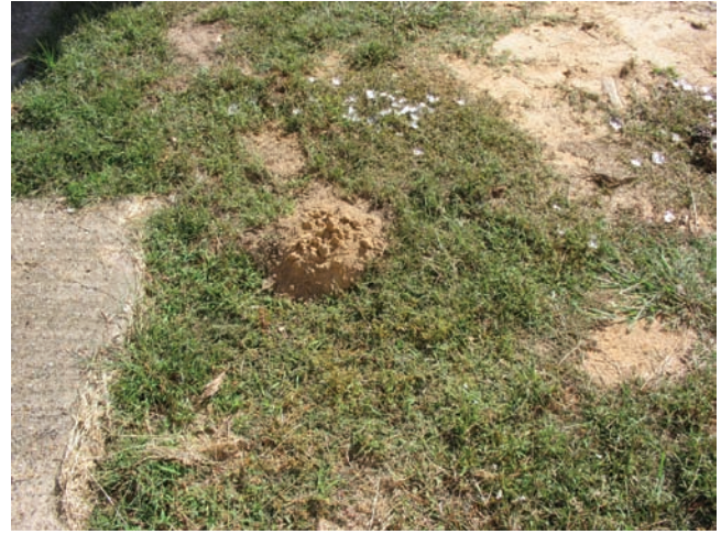
Figure 3b. A large mole mound (8 inches in diameter).

Although both moles and pocket gophers create mounds, they can be easily distinguished through close inspection. Moles build small, conical-shaped mounds (usually less than 1 foot in diameter) by pushing soil out of vertical tunnels ( Figure 3b ). Gophers build relatively large, fan-shaped mounds (greater than 1 foot in diameter) by pushing soil out of inclined tunnels.