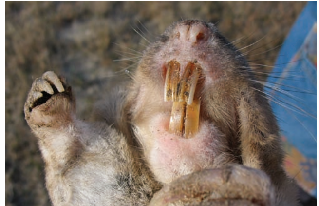
Figure 2. Plains pocket gopher, Geomys bursarius .

Quality habitat for feeding and the area needed for constructing permanent runways (also known as burrows and tunnels) must be available for moles to become numerous, but they rarely exceed a density of three moles per acre.