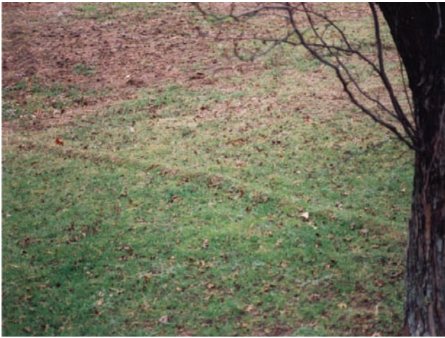
Figure 3a. Burrows and tunnels tend to be long and straight.