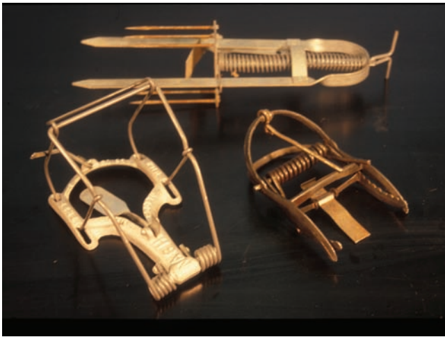
Figure 4. Mole traps clockwise starting from the top: Victor® (harpoon), Out O' Sight® (scissor-jaw), and Nash® (choker-loop).

Traps are usually set in surface burrows. Some of these burrows are used frequently by moles and others are traveled in only once. Avoid burrows in disrepair or which meander around the soil surface. Success is highest when traps are set in active travel burrows ( Figure 3a ).