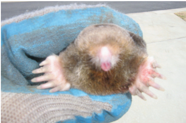
Figure 1. Eastern mole, Scalopus aquaticus .

Moles have short, velvet-like fur varying in color from gray to brown. A fully grown mole is 4 to 6 ½ inches long, not including its short tail. Adults weigh 3 to 5 ounces. The eastern mole has a long naked snout with nostrils that open